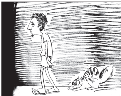
Illustration © 2013 by George O'Connor

Ah, cats. It is hilarious now, but I imagine it would be a lot less funny if she were a dinosaur.