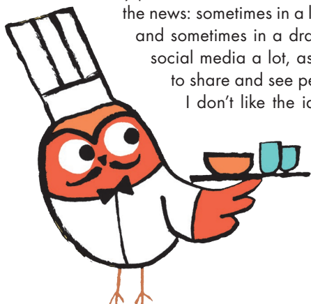
Illustration is my original medium and the one I'm the most comfortable with. But I love a good challenge, which is why I regularly take on projects I'm not comfortable with. I learn a great deal every time I try something a little bit riskier than my usual work. I like to engage the viewer in every project I do; it is at the center of my practice. I often comment graphically on the news: sometimes in a lighthearted way, and sometimes in a dramatic way. I use social media a lot, as it's a great way to share and see people's reactions. I don't like the idea of staying in

my ivory tower, creating work disconnected from the world we live in. I try to make it as relevant (and fun!) as possible. Humor is a very powerful tool that allows me to talk about pretty much anything.