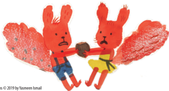
Illustrations © 2019 by Yasmeen Ismail